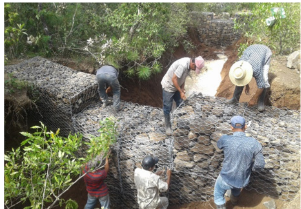
Infiltration ditches under construction by water users of the San Marcos de La Sierra community, El Platanar micro-watershed, Yamaranguila Intibucá (left). Irrigation groups and water board members of San Antonio Valle, Erandique building a series of stone walls to control erosion and sediment, La Chorrera micro-watershed (right).