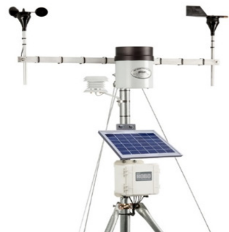
Field teams receive technical training on the use of water quality equipment, which was later transferred to each mancomunidad (left). On the right, a prototype of a remote transmission climate station to be installed in three demonstration micro watersheds.