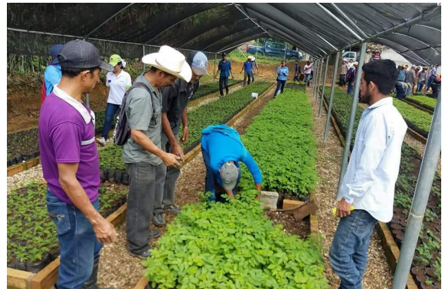
As part of a private-public partnership for ecosystem conservation, community groups receive equipment and tools for forest fire protection (left). Water and irrigation board members receive nursery plants in Erandique, Lempira (right).