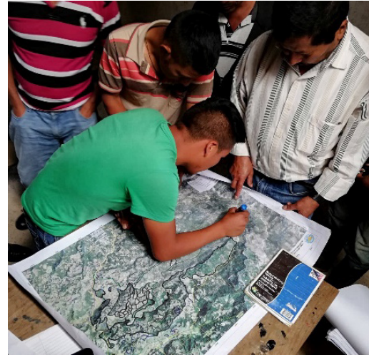
Community members during participatory micro-watershed problem mapping and analysis in Erandique (left) and in Yamarguila, Intibucá (right).