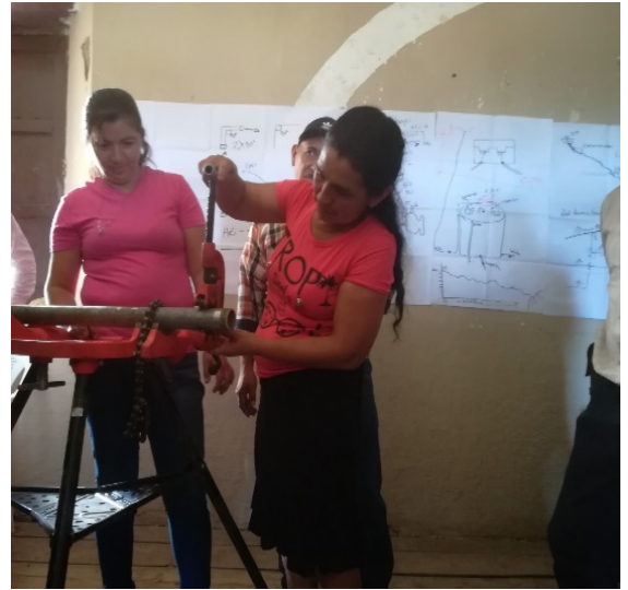
Tegucigalpa Theater Workshop Association performing the Play “Casamiento,” in San Marcos de Caiquín, Lempira, as a way to increase women and youth participation water administration and governance (left), while women participating in water supply system operation & maintenance training.