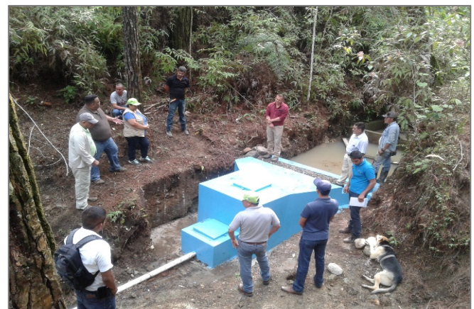
Water boards and municipal staff in La Chorrera micro-watershed, Tambla, Lempira in MANCOSOL show their improved water intake

During the planning process, Global Communities organized seven local theater events composed of municipal and community leaders, including women and youth. These events had three intended goals: to raise public awareness about the need to use water more efficiently, to protect water sources, and to encourage women and youth to assume decision-making positions in water organizations. New youth theater groups were formed, trained, and provided with basic theatrical equipment. Local organizations, including water boards and irrigation groups, were trained in thematic areas ranging from basic organizational functioning, bookkeeping, water system operation and maintenance, water source environmental management, analyses of required water fees, and financial administration.