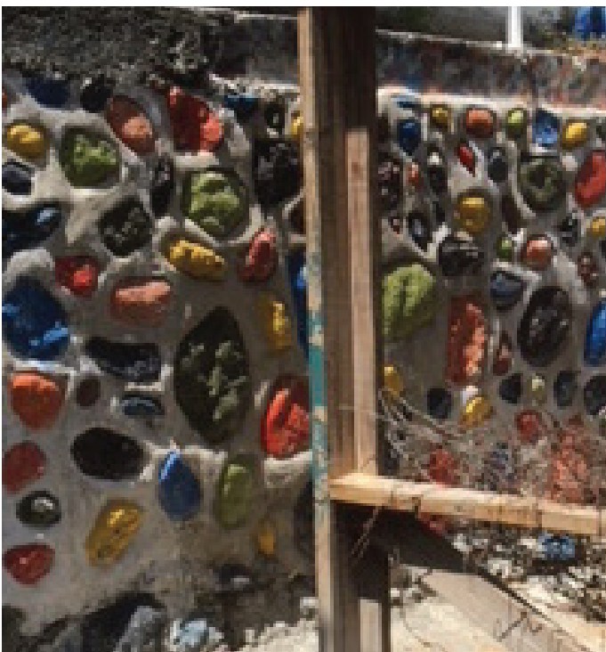
Retaining Wall Decorated by the Community

In 41% of the cases, residents were observed to have made adaptations to the housing, including adding areas for outdoor cooking, livelihood activities, and washing. However, the study found an overall inadequate local capacity to continue to maintain and improve upon housing infrastructure over an extended