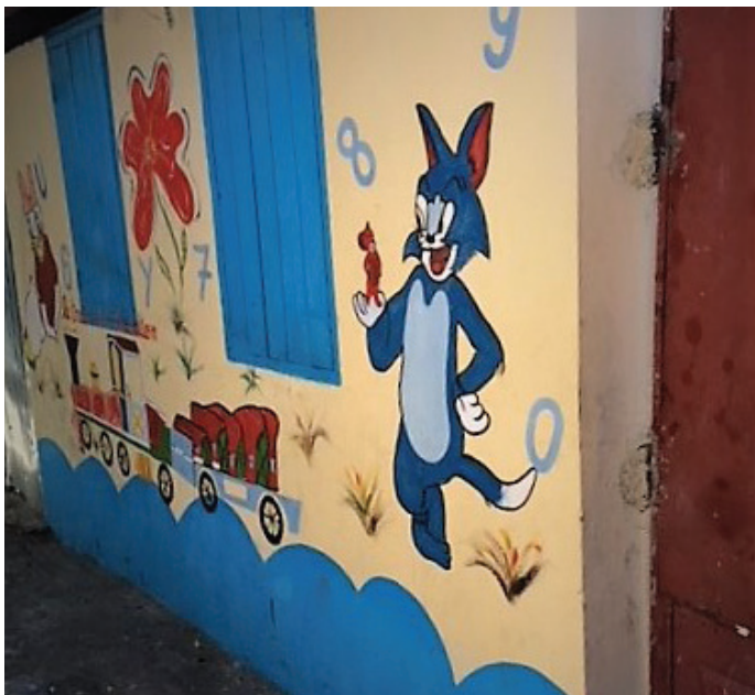
The New School Built in the Community from Shelter Materials Provided by the Project

Overall Perception of Disaster Risk: Perhaps the clearest consensus on the part of the community with regard to the benefits of the project was that it made the community safer. There is a universal perception on the part of the community that the project was able to decrease vulnerability to natural hazards, particularly earthquakes. Among the examples why community members felt that they were less vulnerable were: