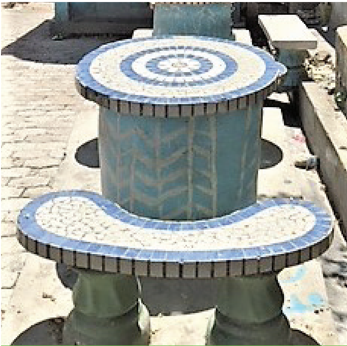
Tables constructed by Katye for community activities

Contrary to commonly held assumptions at the time, rebuilding improved neighborhood and housing infrastructure with better standards did not result in forced evictions or displacement due to a shortage of space. The neighborhood is now home to an estimated 25% more people, and most residents in Ravine Pintade were there before the earthquake.