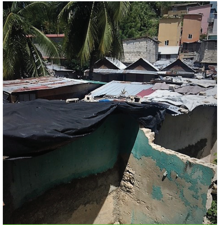
A comparison community. KATYE can be seen across the ravine in the background

PCI studied other communities to assess the degree to which neighborhoods that received more traditional forms of humanitarian assistance had fared over time relative to Ravine Pintade, including areas immediately adjacent to the Ravine Pintade, in Nazon, and Fort National. This included whether they were able to repair and provide shelter, reconfigure the settlement to allow for drainage, improved access and egress, formalize water and sanitation systems, and included the perspective of the community on their recovery. The criteria for inclusion as a comparison community was to have received assistance from humanitarian assistance agencies working across the sectors; like Ravine Pintade, but had not received significant subsequent development or housing programming after the initial phase of humanitarian assistance; and were in areas that were similar to Ravine Pintade in terms of the challenges posed by geography, density, and socio-economic status. PCI also considered recommendations for where to focus the study from the Government of Haiti. Neighborhoods selected were considered representative of other neighborhoods that did not receive assistance similar to that provided in Ravine Pintade.