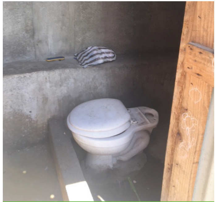
Toilet constructed by Katye

However, study engineers and community members identified several areas of the neighborhood in which the drainage infrastructure has been inadequately maintained and is functioning inadequately. In part, the lapse in maintenance may be due to a decline in the effectiveness of water committees established in each zone of the neighborhood, which were responsible for reinforcing community maintenance of infrastructure. As part of the project, these committees purchased water for resale within the community, a strategy that in its outset saved money for the community (since buying bottled water was exceedingly expensive), and generated savings for the committee that could be utilized for maintaining water and sanitation systems. While the profits from the sale of water were being used to sustainably provide the community access to clean and low-cost water, the study team was unable to find evidence that profits were also being reinvested in sanitation.