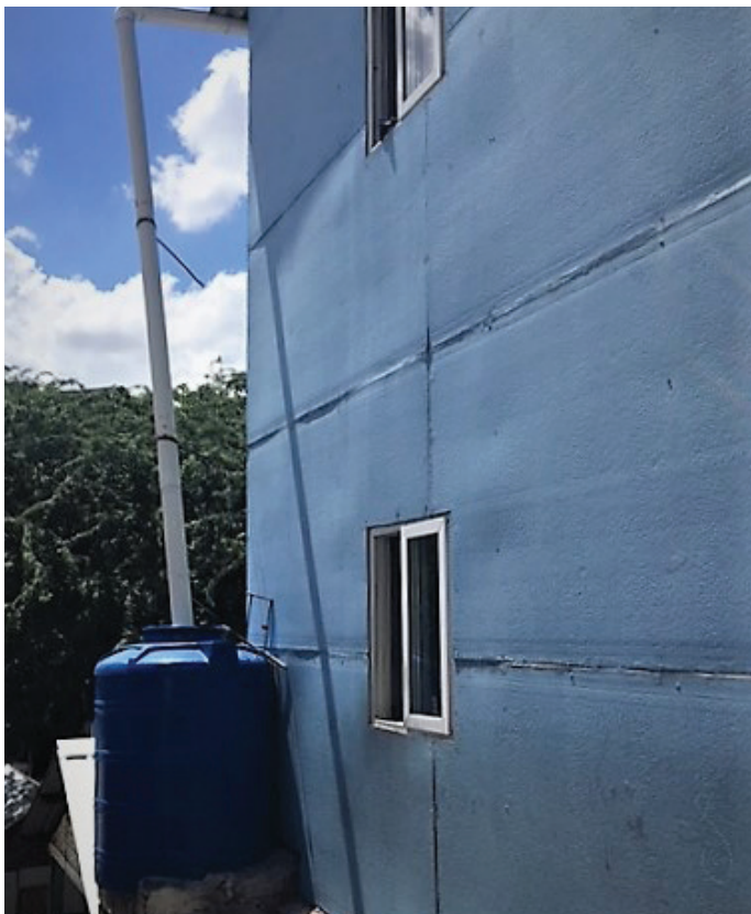
Rainwater Harvesting In Use (2018)

The Status of Sanitation Infrastructure: Prior to the earthquake, 38% of households lacked a latrine. Many households utilized neighbors’ latrines (often for a fee) or relied on