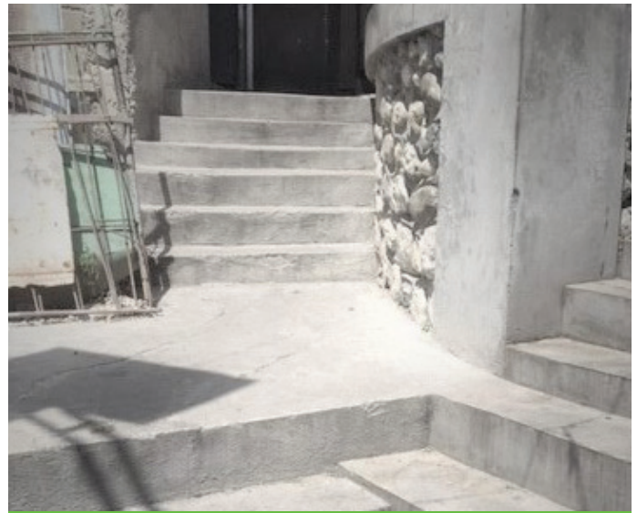
Public walkways, stairs and mitigation infrastructure constructed by the project (photographed in 2018)

Concrete stairways are intact and safe; walkways are clear and passable and largely free of obstructions; and in nearly all neighborhood areas, the public walkways have not been encroached upon for construction of private space or other private purposes. All handrails are intact and well maintained. Retaining walls are in good condition, without signs of damage that could undermine their structural integrity. Public infrastructure intended to promote neighborhood resident engagement and interaction, such as seats and tables, remain intact and usable, available for the public, and have not been re-purposed or privatized. In some cases, they are showing signs of wear and tear due to heavy use. While the solar public lighting installed in coordination with UN agencies and the Government of Haiti were frequently cited as positive contribu-