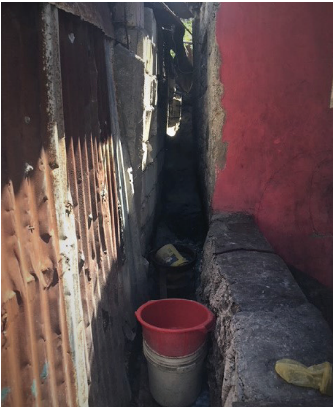
Comparison sites not reconfigured as part of humanitarian assistance had significant challenges related to access and egress

The comparison sites had installed little or no risk mitigation infrastructure, such as retaining walls or formal drainage systems. Rubble that continued to pose a risk to residents had yet to be cleared, including perched on hillsides above community areas, posing significant risk to residents in the event of landslides. Several communities were at risk of flooding and the spread of disease due to unsanitary conditions.