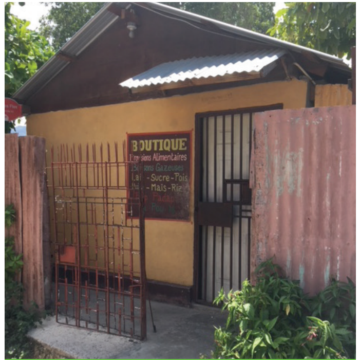
Business in the neighborhood

The Current Status of Water Provision: In order to assess the current status of access to water in Ravine Pintade, the study team examined water infrastructure, management of water points by committees and conducted focus groups and key informant interviews. By most accounts, the water systems constructed by the KATYE project continue to be well