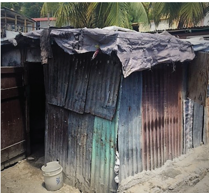
A shelter in a comparison site built with found materials and left-over emergency supplies

In most cases, shelters were built up against those of their neighbors and/or had shared walls. There was little evidence of reconfiguration of houses or other public infrastructure to improve access, install water and sanitation systems or mitigation infrastructure and reduce vulnerability to future shocks and stresses. There was also often no lighting of shared spaces.