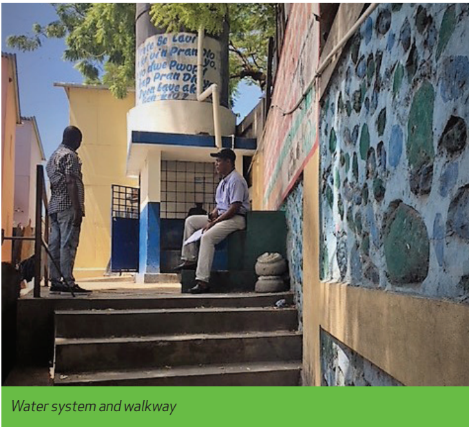
Water system and walkway

PCI and CORE also conducted interviews with governmental representatives, humanitarian assistance policy makers, donors, and members of the academic community with familiarity on the post-earthquake context, approaches utilized by HA agencies, and the Katye project, specifically. In some cases, these interviews were recorded.