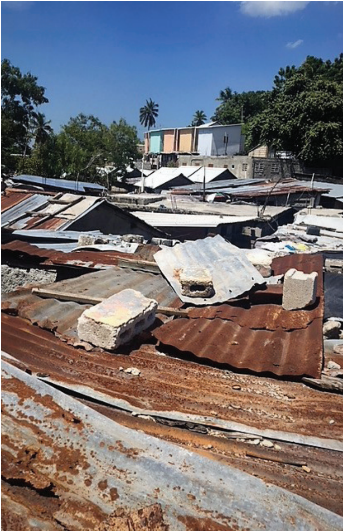
A view of the KATYE project from across the ravine, where people live in continued high levels of risk (photo 2018)

Participating government officials also stated that there was a perception of NGOs as struggling to extend opportunities to communities for substantive participation and a sense of ownership, and instead they created an environment characterized by a dependency on—and competition for—resources given by NGOs. This was likely exacerbated by a lack of coordination and collaboration of NGOs at the neighborhood level and the absence of shared community engagement mechanisms.